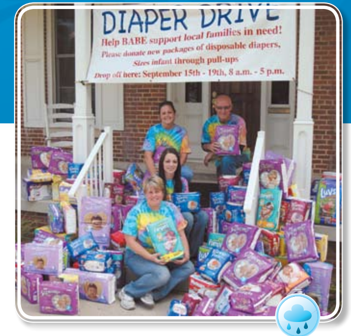
Whitley County Community Staff