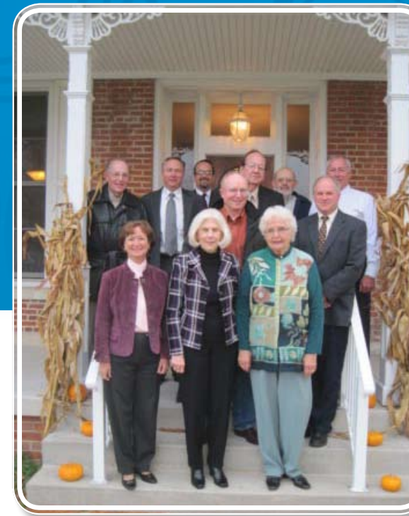
Whitley County Community Foundation Board of Directors